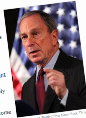
Mayor Michael R. Bloomberg

“The United States of America has come very close to defaulting on its debts — a failure that would have potentially disastrous economic consequences for us all, including New Yorkers — ought to be all the evidence anyone needs that there’s something profoundly wrong in Washington,” Mr. Bloomberg will say, according to the written version of his speech .